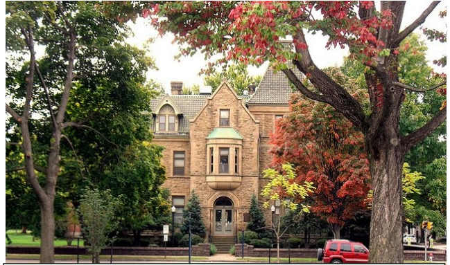
Kirby House in Wilkes-Barre now Kirby Hall for Wilkes University